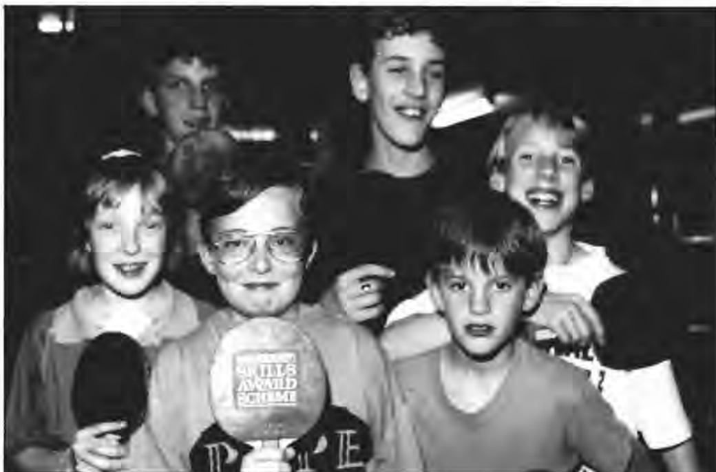
Children at the Cavendish School, Hemel Hempstead, preparing for their Skills Award

The first grade is very much geared towards those having just taken up the sport. Acknowledging early progress encourages the young player during those difficult days of not having