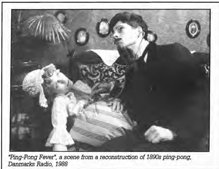
"Ping-Pong Fever", a scene from a reconstruction of 1890s ping-pong, Danmarks Radio, 1988

Sometimes, no doubt, guests ignorant of the game were cajoled