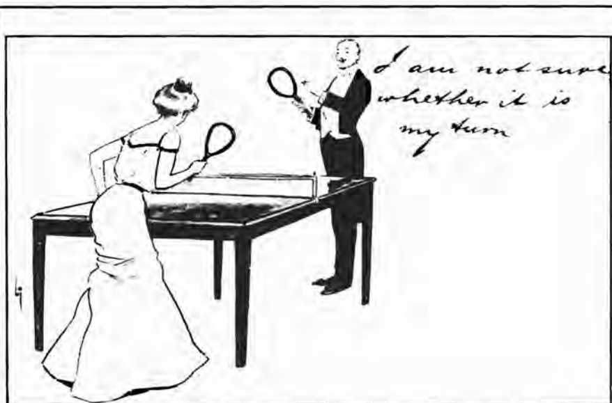
A "write away" postcard, 1902. The message has to be completed by the sender.