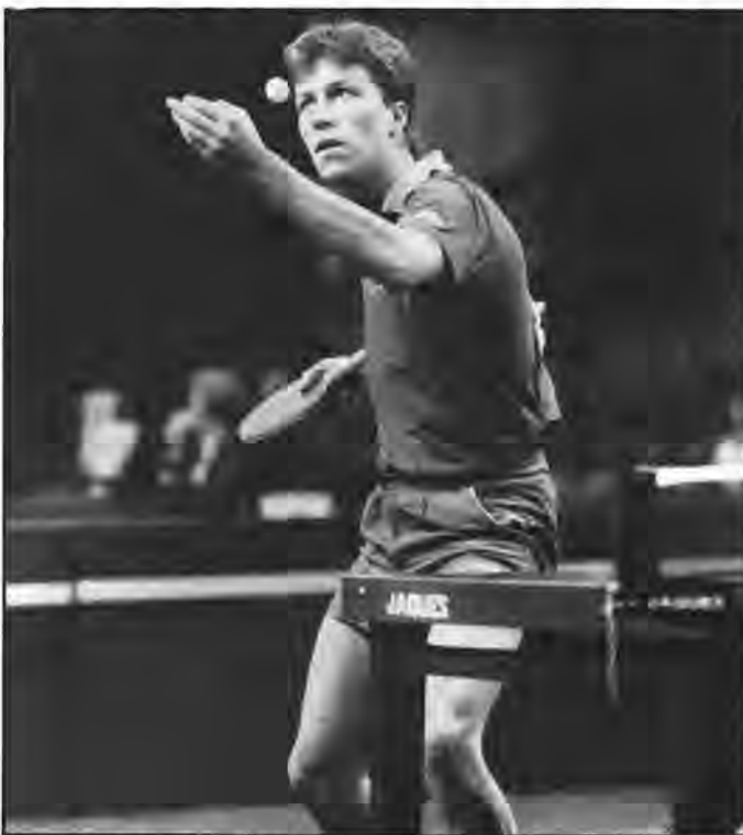
Sweden's Jan Ove Waldner