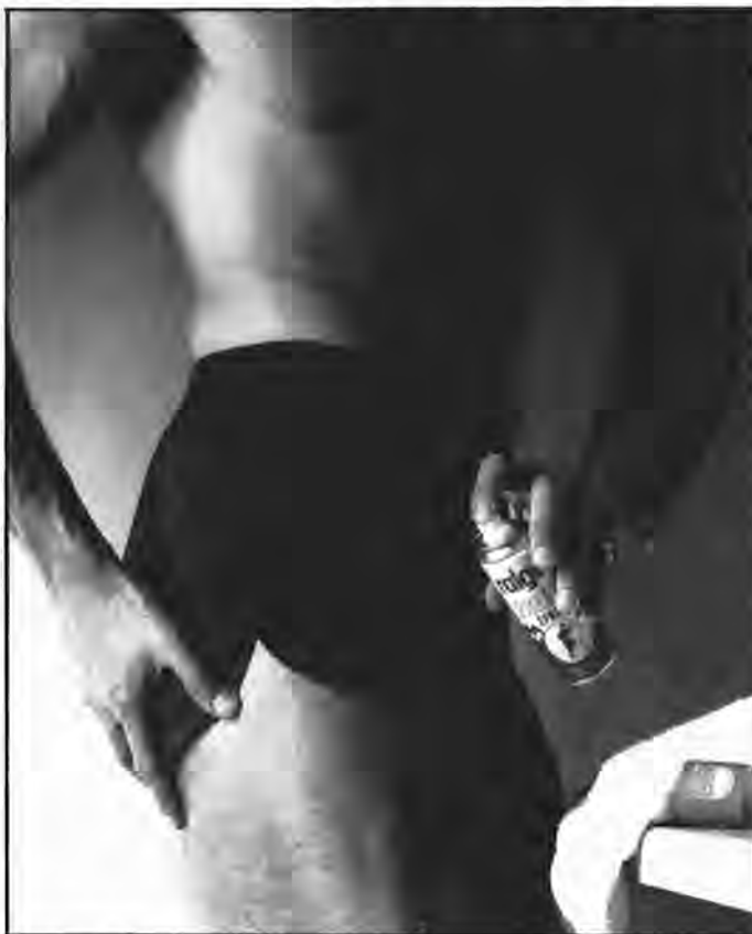
Ralgex freeze spray

The get your Wallchart, send a cheque for £2.99, made payable to Fuji Photo Film (UK) Ltd., to Sports Aid Foundation Wallchart Offer, PO Box 1320, Swindon SN1 4TJ, and you will receive your 1992 Wallchart. Please allow 28 days for delivery.