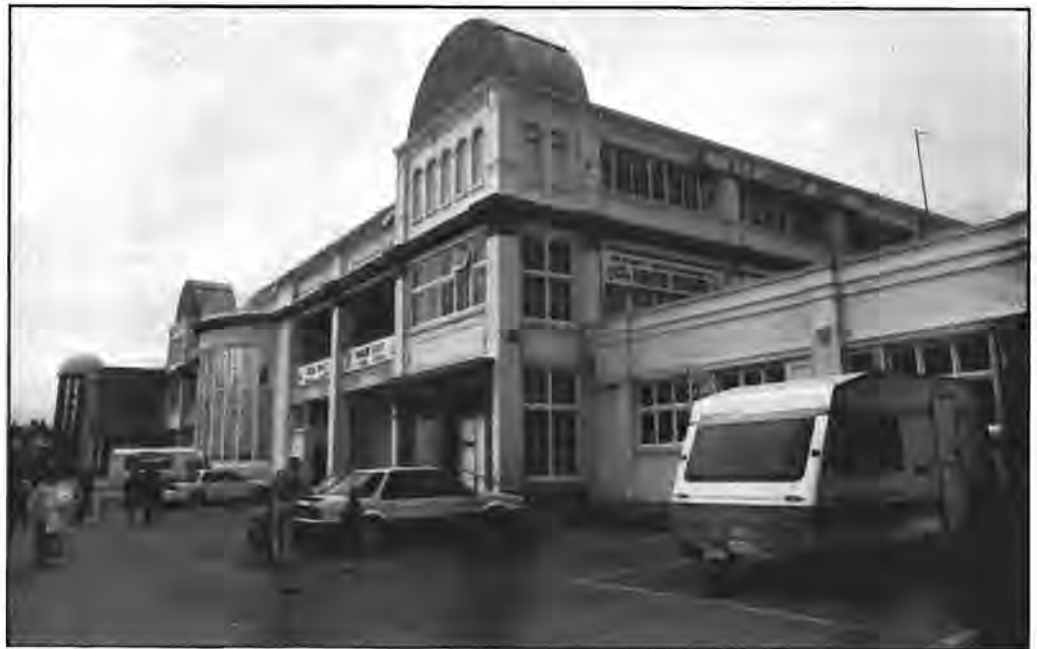
The Royal Spa Hall at Bridlington